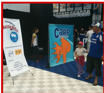
The Human Rights are Aussie Rules display at the North Melbourne Football Club's Family Day